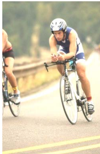
The bike leg of the US National Age Group Championship