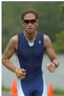
Halfway thru the Half-Ironman run in Morgantown